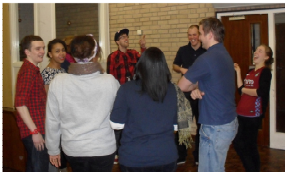
Growing Leaders Training Session