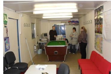
Inside the Pod