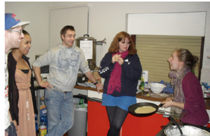
Pancakes at Cell Group

After New Wine last summer, I felt that we needed to look at our youth discipleship. A key reason was that whilst the work was encouraging there it was growing more difficult to manage the needs of a group where the youngest person was 11 years of age and the oldest was 23. I felt that the best way to meet the needs of both would be to have two groups. The young people aged 14+ were invited to attend Growing Leaders and to start a new mid-week cell group based at the Salvation Army (on the weeks in between) and those young people aged 11-16 yrs would continue to meet on Sunday mornings. There is some overlap and transition between the two groups for those young people in the 14-16 yrs.