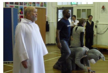
The ACT Team in action