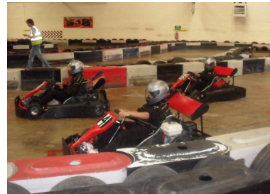
The Scheme Grand Prix

We also took the children and young people out on trips which included the Cinema and Ten-Pin Bowling as well as going to the Snowdome in Tamworth to do swimming, ice-Skating, tobogganing and tubing. The older group also went Go-Karting in Walsall.